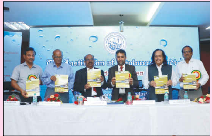
Releasing of Souvenir

The Institution of Engineers (India), Tamilnadu State Center organized a Two day All India Seminar on “Use of Admixtures and Construction Chemicals in Current Construction Industry” at the IE(I), TNSC, Chepauk, Chennai on 10 th and 11 th Aug 2017.