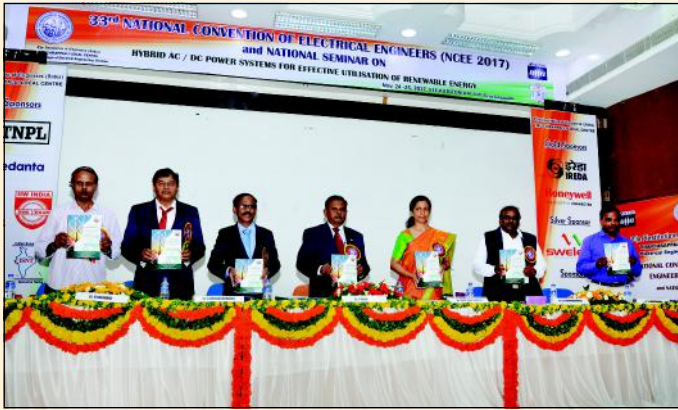
Releasing of Souvenir